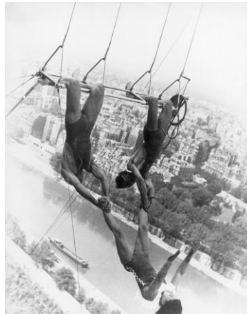
Trapeze artist Rose Gold and two circus performers completing spectacular acrobatic feats while hanging from the Tower (1951)