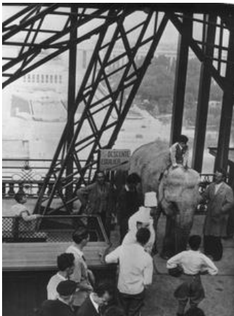
The star elephant of the Bouglione circus who climbed the 327 steps to the first floor of the Tower (1948).

The exhibition is composed of 20 panels presented in chronological order and is free to visit for ticket holders to the Tower, inviting them to discover the most amazing feats witnessed at the monument and paying tribute to those who accomplished them. From the most unusual to the most dizzying stunts, from solo exploits to group achievements, the Tower has inspired many athletes in all disciplines throughout its long history. Visitors will discover, for example, the incredible images of the elephant from Bouglione circus who climbed the 327 steps to the first floor in 1948, the photo of Rose Gold and two fellow trapeze artists performing spectacular acrobatic tricks while hanging from the tower in 1951, and the pictures of highliner Nathan Paulin crossing the 2,200-foot gap between the Eiffel Tower and the Chaillot Théâtre National de la Danse on a one-inch-wide highline in 2021.